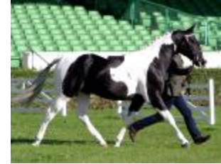
Herith Travelling On

Higher Boyce Farm Stud has a choice of two stallions: